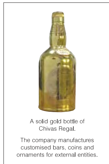
A solid gold bottle of Chivas Regal.

The company manufactures customised bars, coins and ornaments for external entities.