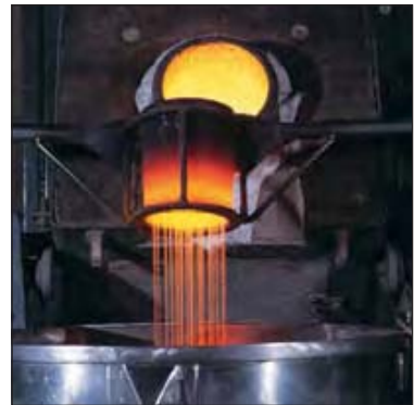
Pouring molten gold to make gold granules.