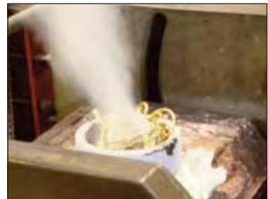
The company is a major international refiner of old gold scrap.