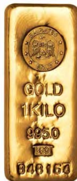
Emirates Gold is the largest manufacturer of cast, minted and pendant bars in the Middle East.