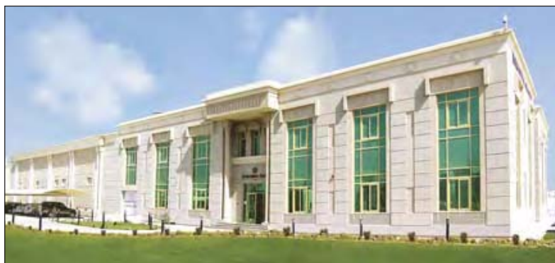
Emirates Gold opened its new refinery in Dubai in 2004.