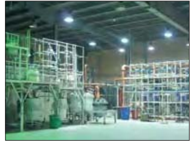
The new DMCC-accredited gold refinery was opened in 2004.

It has its own in-house design workshop and manufactures its own master tools and dies.